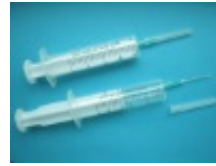
20ml disposable luer slip 2 parts syringe