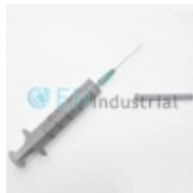
10ml Disposable 2parts syringe