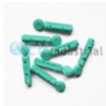
29G Disposable twist blood lancet