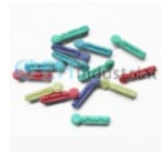
Disposable twist blood lancet