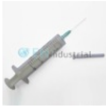
20ml Disposable 2parts syringe