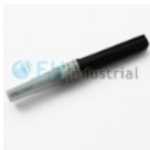
22G vacuum blood collection needle