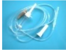
Intravenous infusion set (medical disposable.)