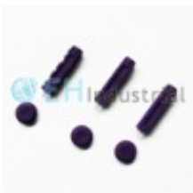
24G Disposable twist blood lancet