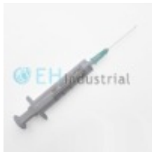
5ml Disposable 2parts syringe