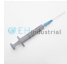
2ml Disposable 2parts syringe