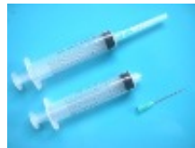
20cc luer lock syringe