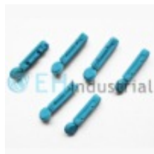
23G Disposable twist blood lancet