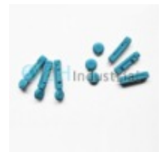
21G Disposable twist blood lancet