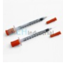
Disposable insulin syringe