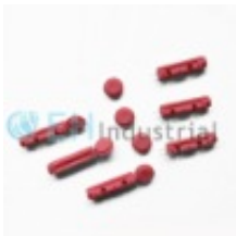
30G Disposable twist blood lancet