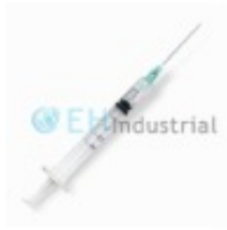
3ml Disposable safety syringe