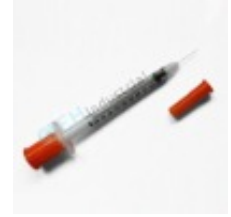
0.5ml Disposable insulin syringe