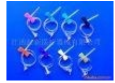
disposable scalp vein needle