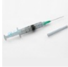
5ml Disposable safety syringe