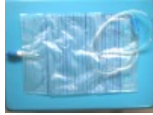
disposable urine bag