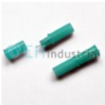
30G Disposable pull blood lancet