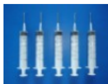
High transparent syringe(CE,ISO13485)