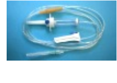
infusion set for single use