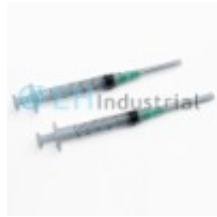
3ml Disposable 3parts syringe