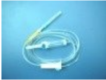
disposable infusion set for single use