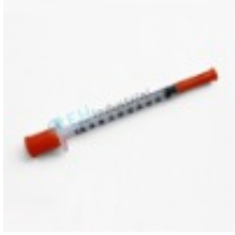
1ml Disposable insulin syringe