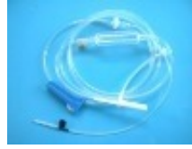
disposable infusion set