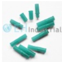
28G Disposable pull blood lancet