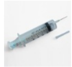
50ml Disposable 3parts syringe