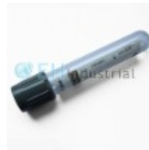
Disposable Glucose Tube