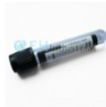
Disposable ESR tube