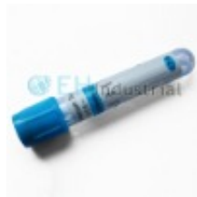
Sodium citrate tube