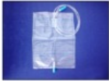
Drainage bag / urine bag