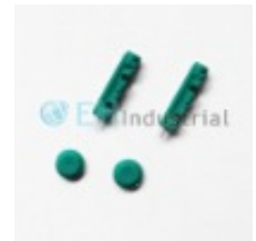
26G Disposable twist blood lancet