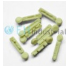
28G Disposable twist blood lancet