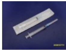
disposable syringe(hypodermic syringe)