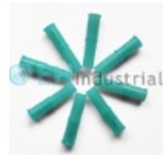
Disposable pull blood lancet