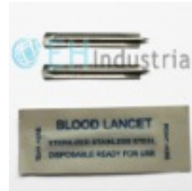
stainless steel blood lancet