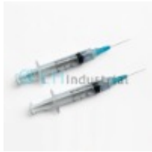
5ml Disposable 3parts syringe