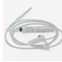
Disposable transfusion set