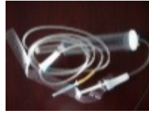
disposable infusion set with burette 100ML