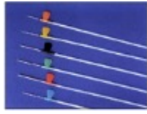
Scalp Vein needle For single use