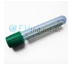
Disposable Heparin Lithium Gel Tube