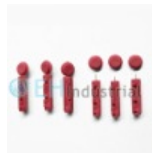
22G Disposable twist blood lancet