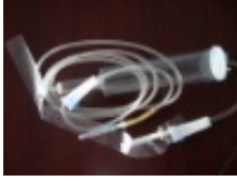
infusion set with buret 100ml