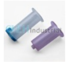
Vacuum blood tube holder