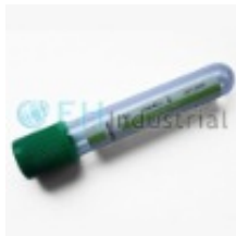
Disposable Heparin sodium Tube