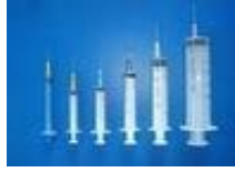
syringe for single use