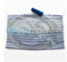
2000ml Disposable urine bag