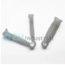
Disposable Umbilical cord clamp