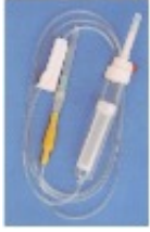
Blood Transfusion Set For Single Use