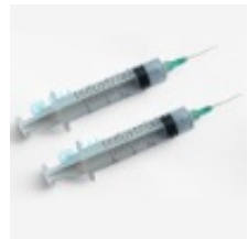
20ml Disposable 3parts syringe