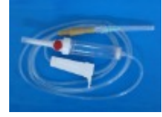
disposable infusion set(iv set.)