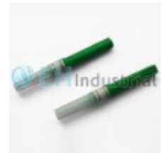
21G vacuum blood collection needle