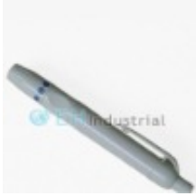
Disposable Lancing device