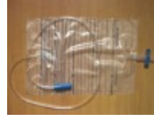
Drainage bag / cross valve outlet urine bag