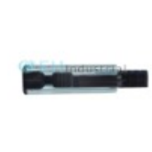
Disposable safety blood lancet