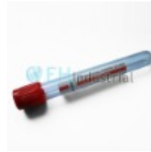
Clot Activator Tube