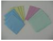
Blue Dental Bib