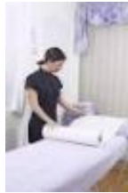
Medical Bed Sheet