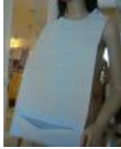
Disposable Dental Apron