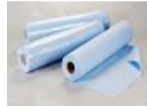
Massage Table Cover