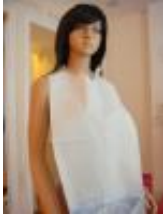
Disopable Apron With Pockets