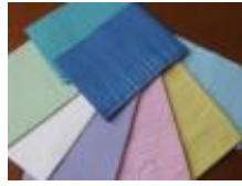
disposable paper bib