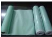
Disposable dental bib roll/Couch cover roll/medical paper roll