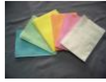
Disposable Dentabl Bib