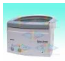
Ventilator Humidifier Mr810 For Sale