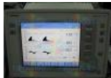
Aeon 590 Ventilator Repair