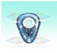
VADI Adult Ventilator Mask For Sale