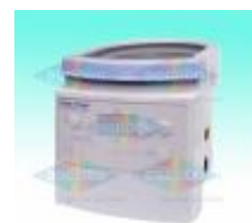
Ventilator Humidifier (Mr 850 ) For Sale