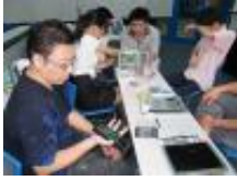
Patient Monitor Repair Training (Advanced)