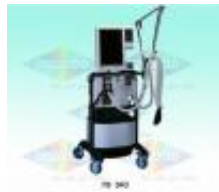
PB840 ventilator repair