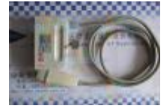
TOSHIBA PSM-25AT ultrasound transducer