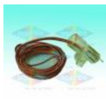
Breathing Circuit Guide Wire For sale