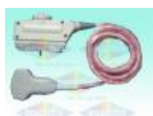
MENDISON C3-7ED ultrasound probe