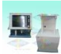
Drager Evita 4 Compressor Repair