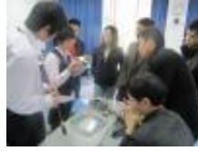
Patient Monitor Repair Training (Middle)