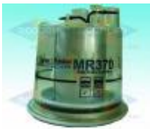
Humidification bottle MR370 for sale