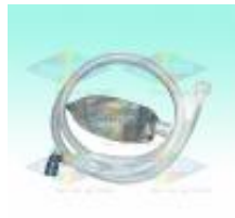
VADI Children Anaesthesia Circuit For Sale