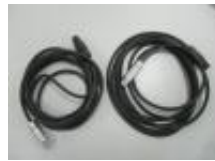
Stryker 5100-4 Electric Cable Repair