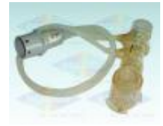
Bird 8400 Flow Sensor For Sale