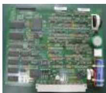
SERVO-S PC1772 Board Repair