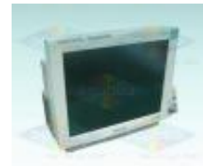
Philips MP60 Patient Monitor Repair