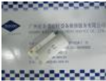
Philips M3001A module for sale