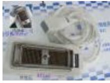
ALOKA UST-5299 heart probe Repair