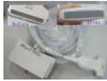
ACUSON 15L8W HF probe Repair