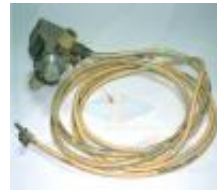
Siemens 900C air-oxygen blender for sale