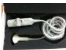
PHILIPS C5-2 Probe