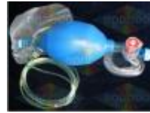
VADI Adult First Aid Resuscitator For sale