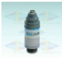
NEWPORT-500 Ventilator Oxygen Cell For sale