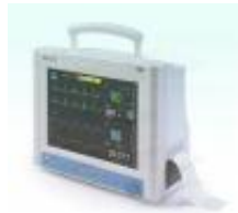
supply Mindray MEC 1000 accessories