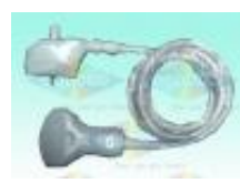
ALOKA UST-934N Probe