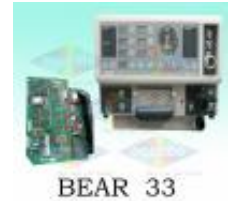
Bear 33 Ventilator Repair