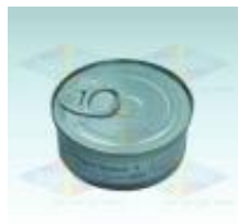
OHMEDA Oxygen Cell For Sale