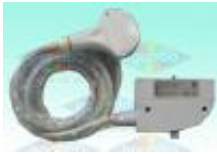
SIEMENS 3.5C40S Probe