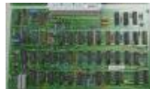
SIEMENS 900C PC757 Circuit Board Repair