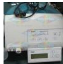
Drager Ventilator Start Alarm Repair