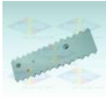
SIEMENS Adult Humidifier Distinctive Paper For Sale