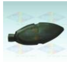
Siemens Adult Test Lung For Sale