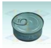
SIEMENS Servo-I Oxygen Cell For Sale