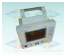
HP A3 Patient Monitor Repair