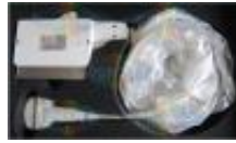
GE 3.5C ultrasound probe