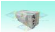
Repair PHILIPS M3015A and M3001A module