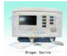
Drager Savina Ventilator repair