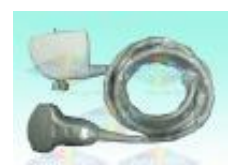
MINDRAY 35C50EA ultrasound probe