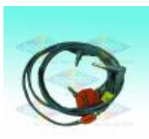
Breathing Circuit Temperature Probe for sale