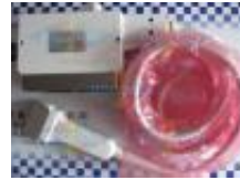
GE 10LB ultrasound probe