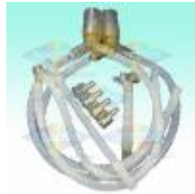
VADI Neonate Silicagel Circuit For Sale