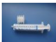
Disposable Oral Syringe