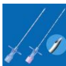
Disposable epidural needle