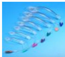
Disposable PVC LMA