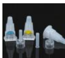
Disposable insulin pen needle