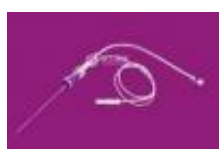
Nerve Stimulate needle