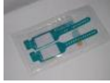
Disposable I.D card