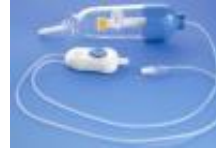
Disposable infusion pump