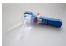
Disposable Vaginal Speculum light