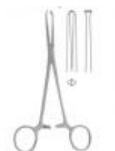
Allis Tissue Forcept