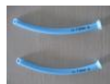
Disposable Nasopharyngeal airway