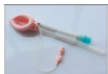
Laryngeal mask , double tube