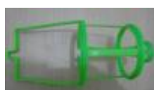
I.V bottle hanger