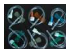
Disposable scalp vein set