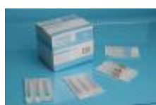
Disposable syringe needle