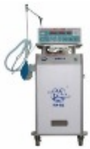
TKR-300H Computerized Ventilator for Animals