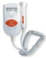
Pocket Fetal Doppler with CE and FDA