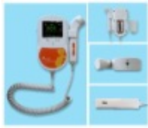
Fetal Doppler with CE