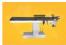
TL-1C Electric Operating Table