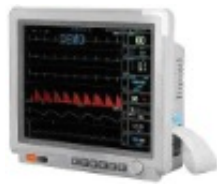
G3L patient monitor