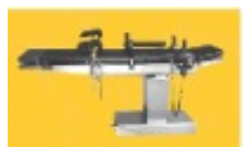
TL-2A Electric Operating Table