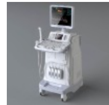
Color ultrasound machine (color doppler)