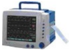
G3C patient monitor