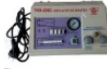
TKR-200C--Small Animals Ventilator