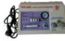
TKR-200C Ventilator for Animals