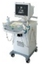
Ultrasound machine ( white and black)