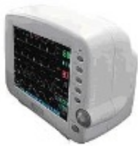
G3F patient monitor