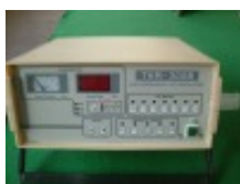
Portable ventilator, high-frequency ventilator, easy operation