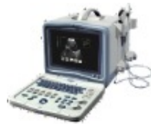
Ultrasound scanner machine with full digital