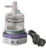
Heated Humidifier.ventilator humidifier.humidifier unit.humidifier