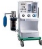
4B Multifunctional Anesthesia Unit