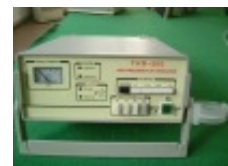
medical ventilator, portable, easier operation, cost-effective