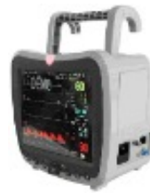
G3H patient monitor