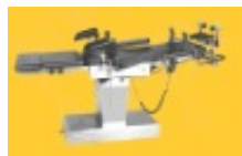
TL-1B Electric Operating Table