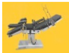
TL-1A Electric Operating Table