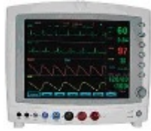
G3D patient monitor