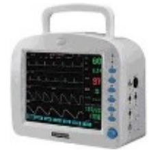
G3G patient monitor