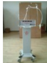
ICU ventilator, high-frequency jet ventilator,