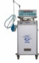
professional Big Animals Ventilator TKR-300H