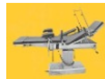
TL-2D Electric Operating Table