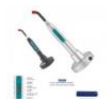
dental light cure