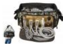
Portable dental unit