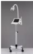
Teeth Whitening system