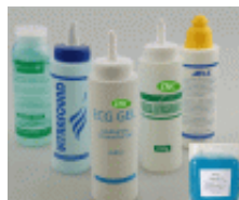
Medical Ultrasound Gel