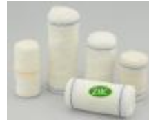
100% Cotton Crepe Bandage