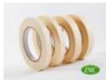
Autoclave Indicator Tape