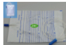
Economical Urine Bag