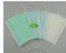
Non-woven Face Mask