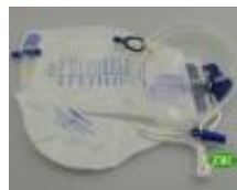
Luxury Urine Bag