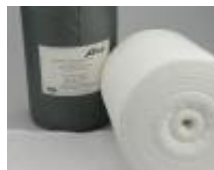
Absorbent Gauze Rolls