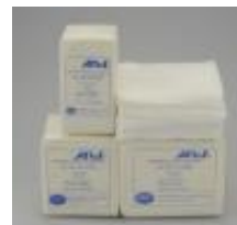
Absorbent Gauze Swabs