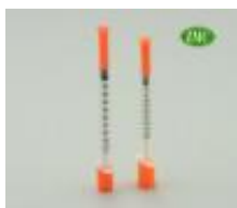
Disposable Insulin Syringe