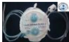
Wound Drainage Reservoir