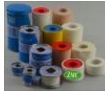
Zinc Oxide Adhesive Plaster