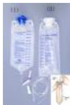
Enteral Feeding Bag