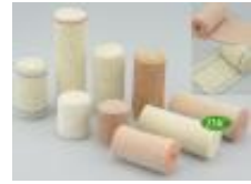
Spandex Crepe Bandage