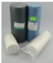
Absorbent Cotton Wools