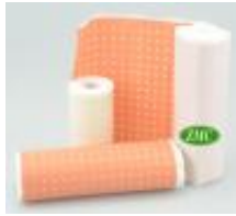
Perforated Zinc Oxide Plaster