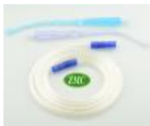
Yankaur Suction Set