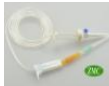
Disposable Infusion Set