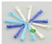
Umbilical Cord Clamp