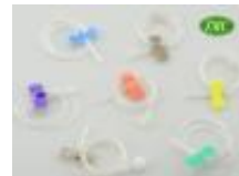
Scalp Vein Set