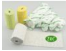
Plaster of Paris Bandage