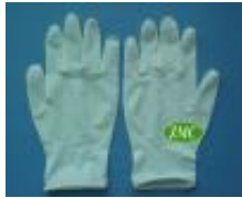
Latex Examination Gloves