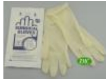
Surgical Latex Gloves