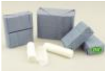
Absorbent Gauze Bandage