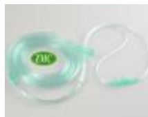
Nasal Oxygen Tube